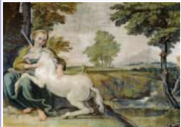
'The Gentle Maiden has the Power to Tame a Unicorn.' Domenichino (1504).