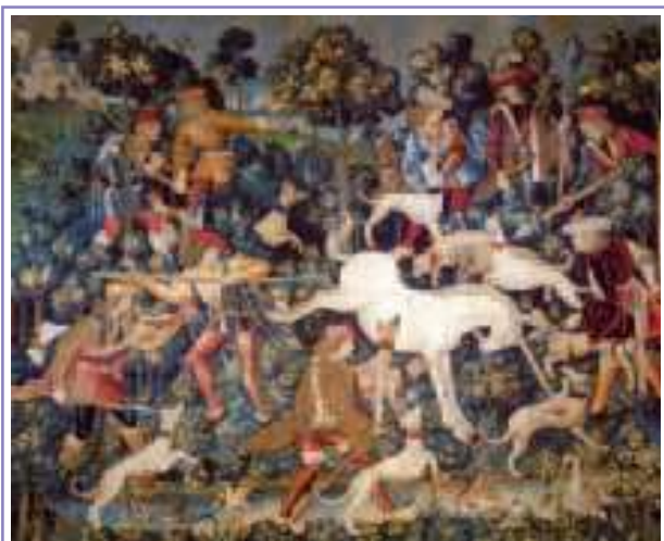
'The Unicorn Defends Itself' Tapestry, c. 1500