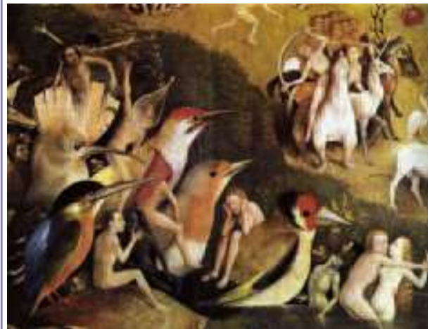
The Garden of Earthly Delights,' Hieronymus Bosch, 1485

(can you spot the unicorn in the top right hand corner?)