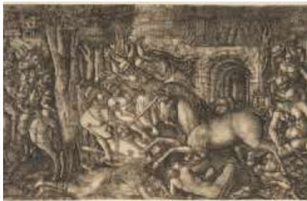
'King Pursued by a Unicorn' Jean Duvet (1485-1561)

(can you spot the unicorn in the top right hand corner?)