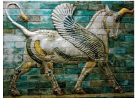
Unicorn from Apadana, Shush, Iran