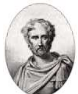
Pliny the Elder