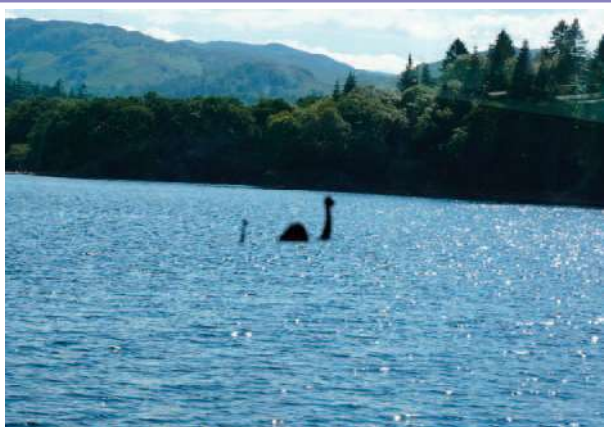
Loch Ness Monster