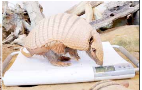
Eddie and Patsy at play – and being checked on the zoo's weighing scales