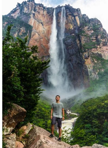
Angel Falls in Venezuela (the world's highest waterfall)