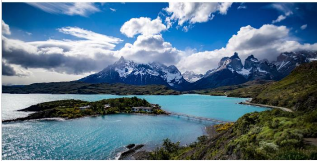
Torres del Paine National Park in Argentina/Chile