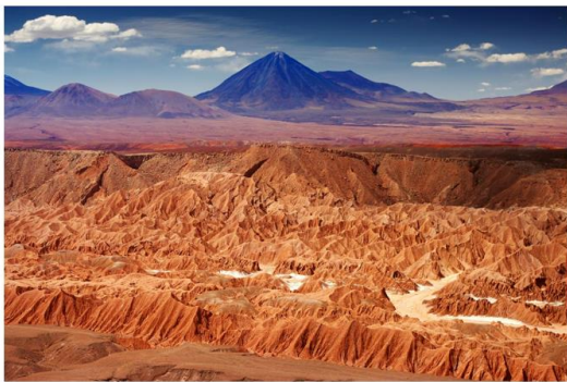
Atacama desert covering Chile and Peru (is the driest place in South America)