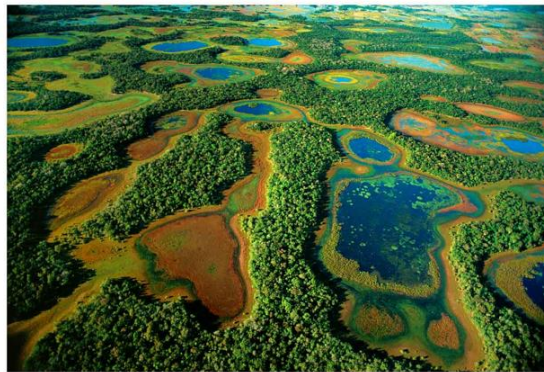
Pantanal in Paraguay/Brazil (world's largest tropical wetland area)