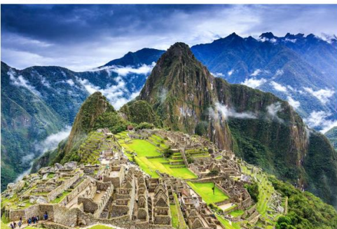
Macchu Picchu in Peru