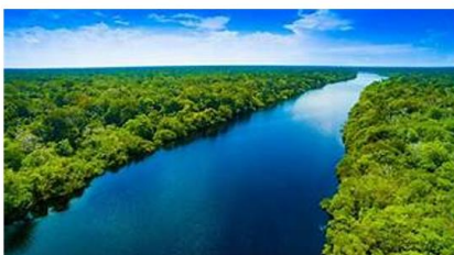
Amazon River in Brazil, Colombia and Peru