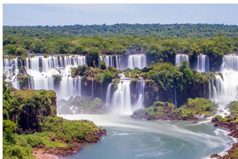
Iguazu Falls in Argentina/Brazil