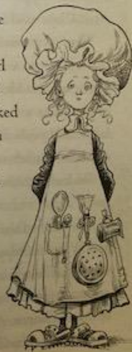
RUBY THE OUTER-PANTRY MAID

'Please, call me Ada. Lovely to meet you. None of the maids have ever talked to me before,' she said as Ruby shyly shook her hand.