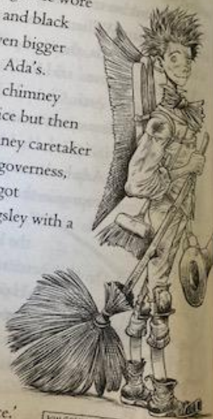
KINGSLEY THE CHIMNEY CARETAKER

'And I look after your father's hobby horse, Pegasus,' said Arthur, not wanting to be outdone. 'I'm getting it ready for the metaphorical bicycle race.'