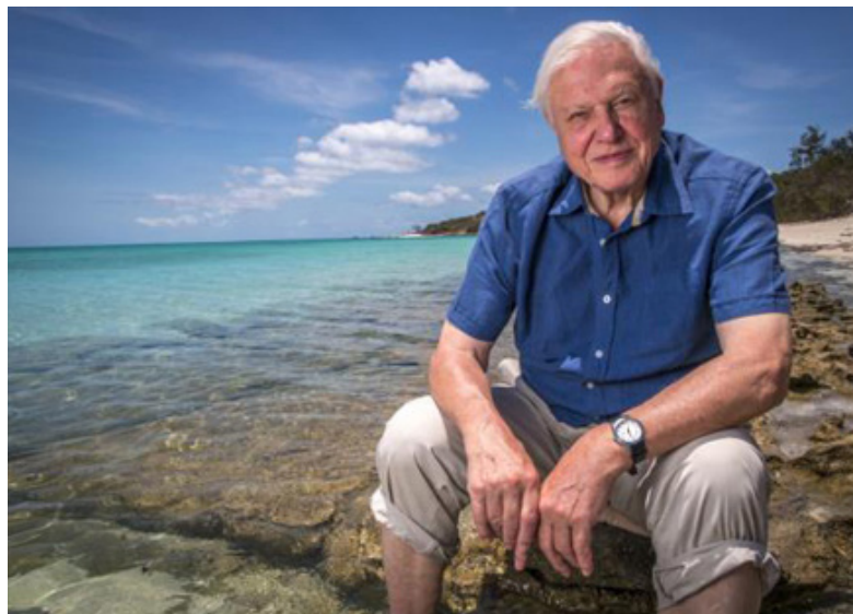
"David Attenborough at Great Barrier Reef"

Attenborough loved to collect fossils and stones when he was a little boy. He studied zoology at university so he could learn all about animals and their habitats.