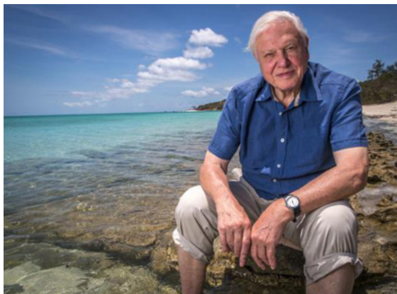
"David Attenborough at Great Barrier Reef"