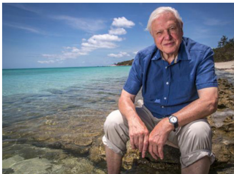
"David Attenborough at Great Barrier Reef"

When he was 19 years old, he went to Cambridge University to study geology and zoology. He learnt lots about rocks, animals and the environment.